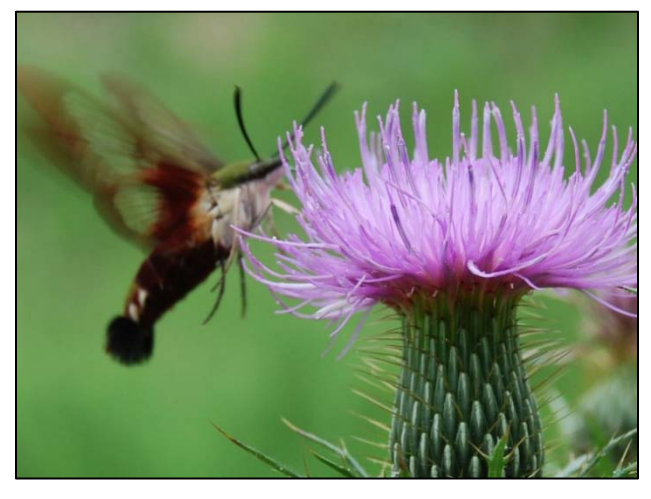
Field thistle flower and hummingbird clearwing moth.